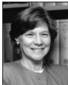
Hon. Maureen Lally-Green