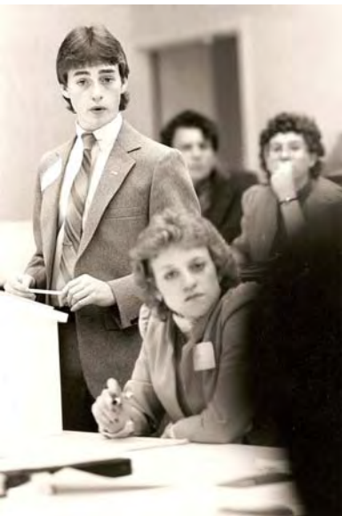
Students from Elkader, Iowa participate in a round during the first national tournament.